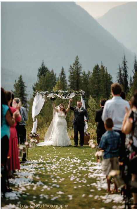
Lolo & Noa Photography