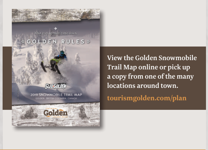
View the Golden Snowmobile Trail Map online or pick up a copy from one of the many locations around town. tourismgolden.com/plan

SAFETY IS YOUR RESPONSIBILITY Safety in the mountains, particularly in the winter, should be taken very seriously. Please ensure that you are prepared with the correct equipment, training, skills, knowledge, and expertise before venturing out. In particular, know the avalanche risk areas. Check road and weather conditions, including avalanche risk, active logging, and restrictions that may be applied to forest service roads. Pack adequate food, water, clothing, topographical maps, and gear including a first aid kit and bear spray. Travel in a group. Tell someone where you are going, when you will be back, and an emergency contact number if you do not return.