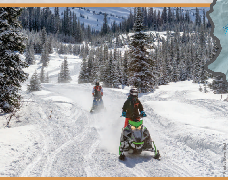
ABOUT THE OUTDOOR DISCOVERY MAP This map is intended to highlight the amazing backcountry terrain and activities that such. Travelers in the backcountry are advised to carry topographical maps.

IMPORTANT INFORMATION & CONTACTS: Canadian Avalanche Centre: www.avalanche.ca RCMP 250-344-2221 RCMP Emergency 911 Search & Rescue 250-344-5902 Safety and essential tips: www.adventuresmart.ca